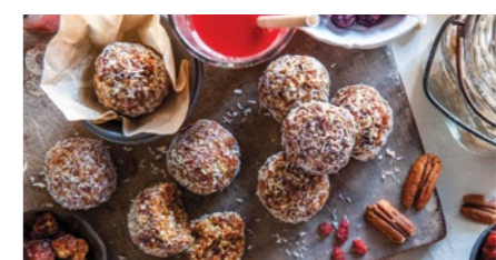
SUPER BERRY VITALITY BALLS (GF)

A highly effective natural energy enhancer made with organic almonds, dates, coconut, loaded with vegan protein and raw cacao CODE: LSBCP • 20 PACK • 30mm • 40G • STORE AMBIENT 30 DAYS