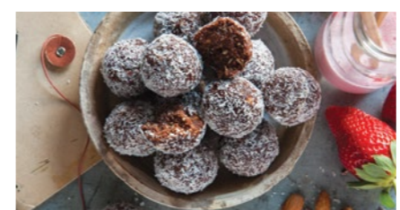
ORGANIC CHOC PROTEIN BALLS (GF)

Gut health made delicious! With cashew butter, coconut, organic cacao, hazelnuts + 1 billion belly loving probiotics! CODE: LSBHP • 20 PACK • 30mm • 40G • STORE AMBIENT 30 DAYS