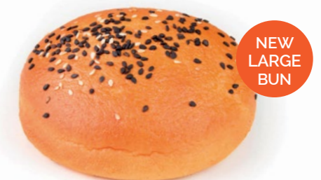
LARGE GF SWEET POTATO BUNS (VEGAN)

CODE: LSBSP • 2 PACK • 85G • 90x25mm • STORE AMBIENT 3 DAYS