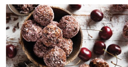
CHEERY RIPE BLISS BALLS (GF)

Bountiful bliss. Organic almonds, cashews and coconut blended with vegan protein and real vanilla bean CODE: LSBVP • 20 PACK • 30mm • 40G • STORE AMBIENT 30 DAYS