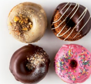
VEGAN ORGANIC DONUTS (4 PACK) (GF)

finely ground almonds, apple puree and cold-pressed sunflower oil. Add some omega rich flaxseeds, raspberries, raw cacao, maple syrup, pecans and beetroot juice, and why wouldn't you have a donut for breakfast? Available in assortment boxes of four.