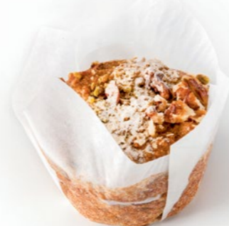
VEGAN ORGANIC CARROT VITALITY MUFFIN (GF)

CODE: LSMB • 80x50mm • 155G • 4 PACK STORE AMBIENT 4 DAYS