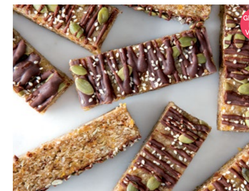
RAW THC - VEGAN TAHINI HEMP CHOC BAR (GF)

CODE: LSSHB • 12 PACK • 45x30mm • 55G • STORE COLD 14 DAYS