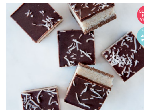
VEGAN BOUNTY SLICE (GF)

CODE: LSBF • 10 PACK • 90x30x20mm • 80G • STORE AMBIENT 7 DAYS