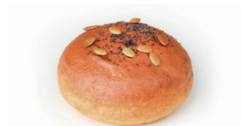
GLUTEN FREE SWEET POTATO BUNS (VEGAN)

GLUTEN FREE • VEGAN • DAIRY FREE • EGG FREE ALL NATURAL • DELICIOUS