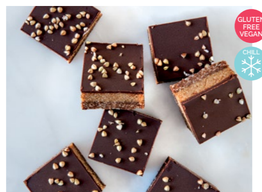
VEGAN RAW SALTED CARAMEL SLICE (GF)

Coconut, cranberry (apple juice), rice malt, date, cocoa butter, buckwheat, sunflower, cacao, maple, beetroot powder, orange oil CODE: LSSBR • 12 PACK • 45x30mm • 55G • STORE COLD 14 DAYS