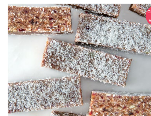
RAW CVB - CRANBERRY & COCONUT VEGAN BAR (GF)

CODE: LSSBO • 12 PACK • 45x30mm • 55G • STORE COLD 14 DAYS