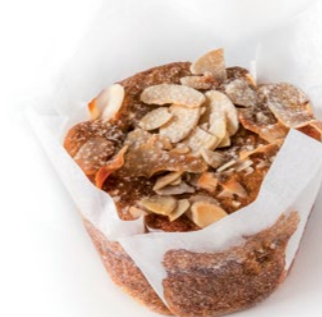
VEGAN ORGANIC MAPLE HARVEST MUFFIN (GF)

CODE: LSMCA • 80x50mm • 150G • 4 PACK STORE AMBIENT 4 DAYS