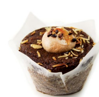
VEGAN ORGANIC CHOCOLATE POWER MUFFIN (GF)

CODE: LSMM • 80x50mm • 150G • 4 PACK STORE AMBIENT 4 DAYS