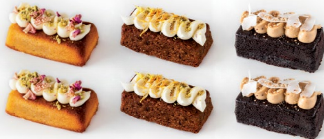
VEGAN ORGANIC TEACAKES (6 PACK) (GF)

almonds, buckwheat, amaranth, quality seeds, nuts and cold-pressed sunflower oil. Tinged with nostalgia and dressed in tradition, Li'l Sprout Teacakes will never be out of favour. Could dessert be any sweeter? Available in assortment boxes of six.