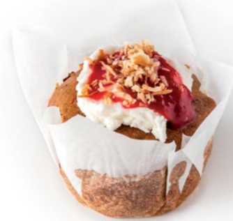
VEGAN ORGANIC CHIA BERRY MUFFIN (GF)

Made from all natural ingredients and free from gluten, dairy, eggs, animal products, additives, artificial preservatives and refined sugars, Li'l Sprout Muffins are as good for you as they look and are available in four delicious flavours.