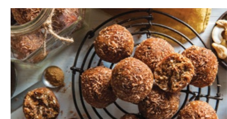
SALTED CARAMEL CACAO CRUNCH BALLS (GF)

Anti-inflammatory turmeric and orange oil blended with rich raw cacao to create the ultimate healthy truffle CODE: LSBCO • 20 PACK • 30mm • 40G • STORE AMBIENT 30 DAYS