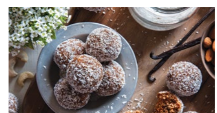
ORGANIC VANILLA BEAN PROTEIN BALLS (GF)

A superfood energy burst made with antioxidant rich berries, inca, goji, mulberry, cranberry, pecan and cashew CODE: LSBBS • 20 PACK • 30mm • 40G • STORE AMBIENT 30 DAYS